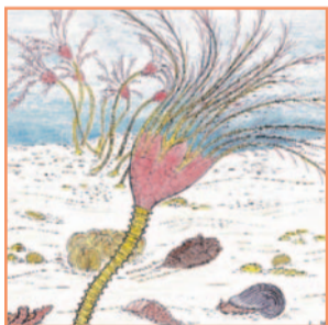
Artist's reconstruction of a Silurian sea

During Silurian times this area lay about 30° south of the equator. To the east lay a continent, to the west beyond the Welsh Borders was a deep ocean. Here stood a warm shallow ocean teeming with life. Sediments laid down in these tropical waters over time would form into limestone and siltstone. By the late Silurian, sea levels started to fall as the continents either side of the ocean converged. Gradually the ocean disappeared to be replaced by a range of high mountains comprising what is now North Wales, the Lake District and Scotland. As these mountains eroded vast quantities of materials were transported south via streams and rivers. These sediments over time formed into the rocks of the Raglan Mudstone Formation.