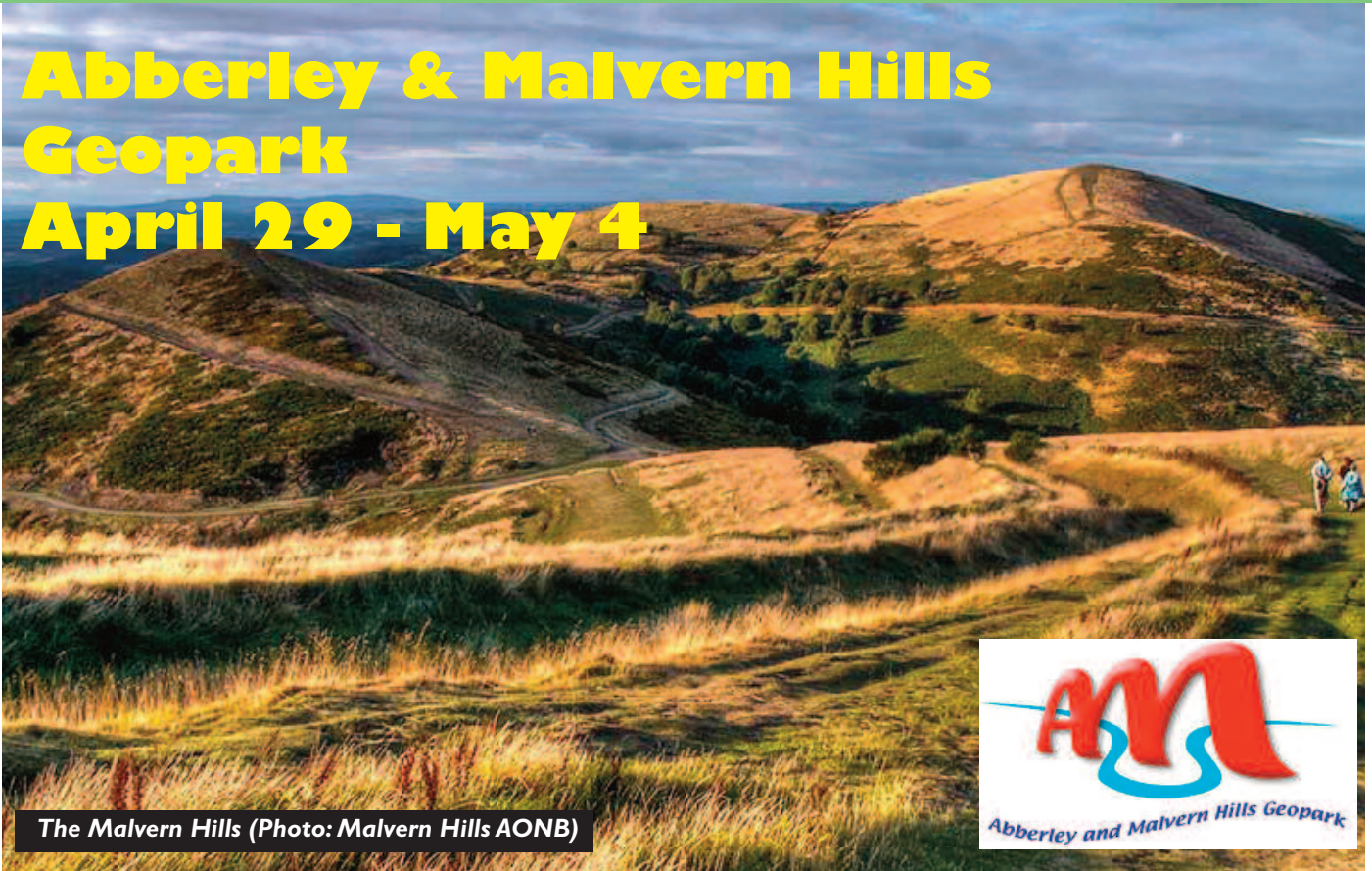
The Malvern Hills